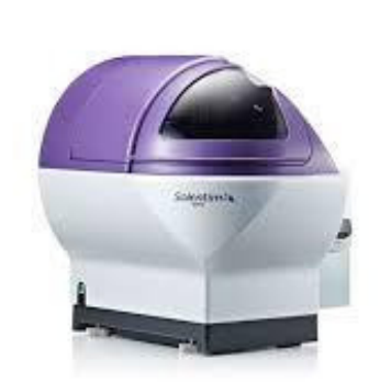
Figure 2: The Solentim VIPS™ Imager

From the day of seeding and throughout the clonal growth phase, VIPS performs daily high clarity whole-well imaging, recording a timeline of well images and performing analysis to measure confluency (Figure 3). Successful clonal outgrowth can be traced back to a single cell both at the seeding event and the first whole-well image to provide dual lines of monoclonality evidence.