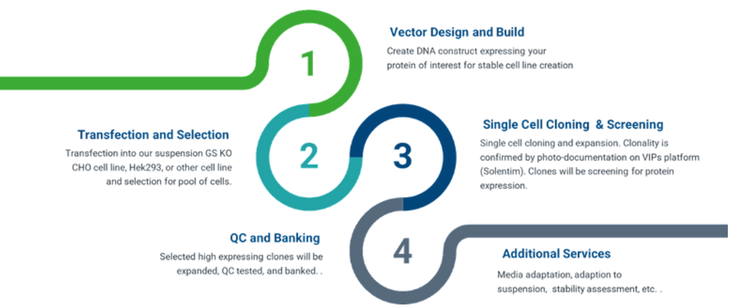
Figure 1: Overview of the Cell Line Development Process